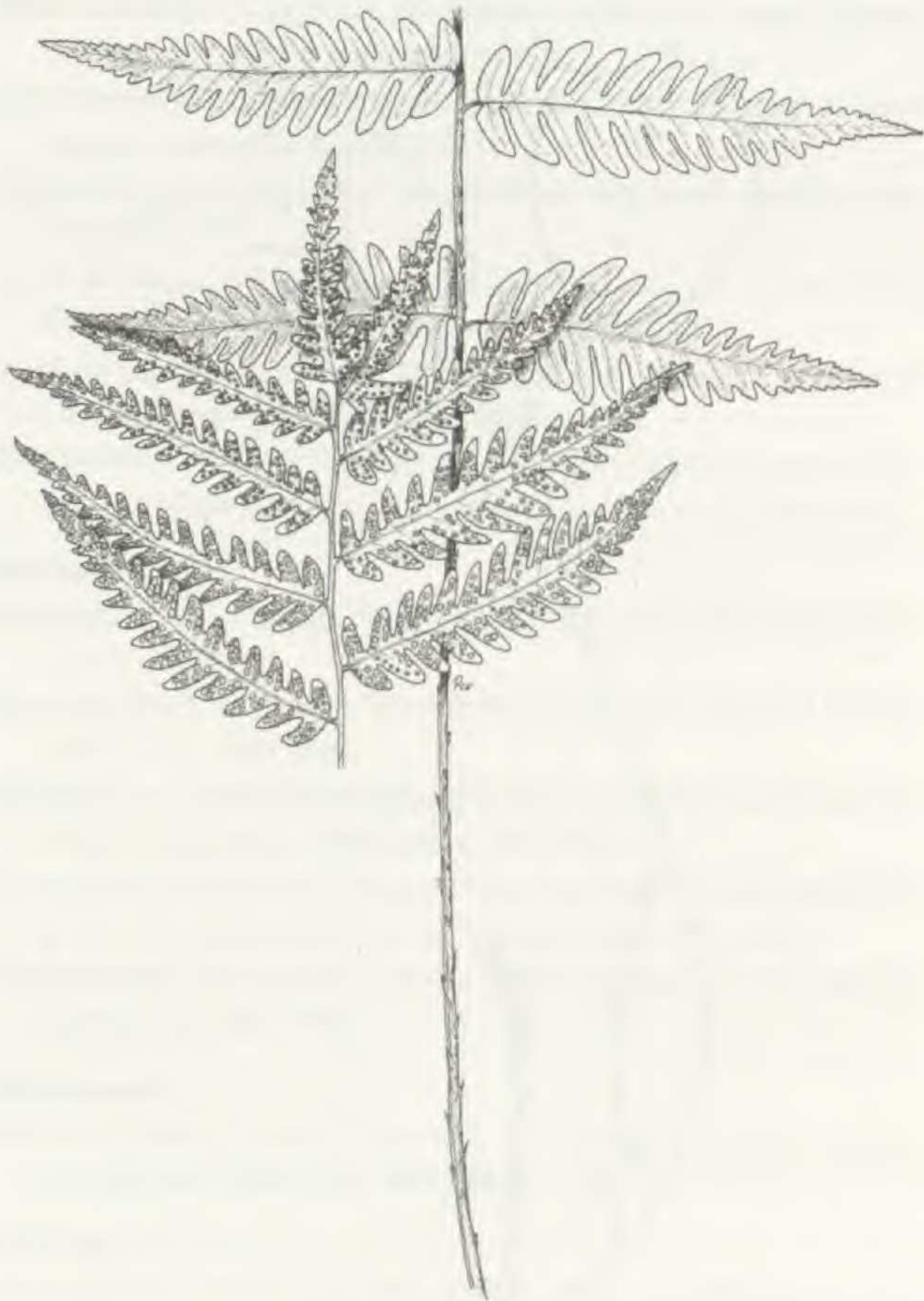
FIG. 3. Dryopteris x australis .